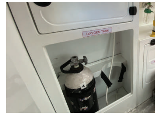
OXYGEN TANK COMPARTMENT