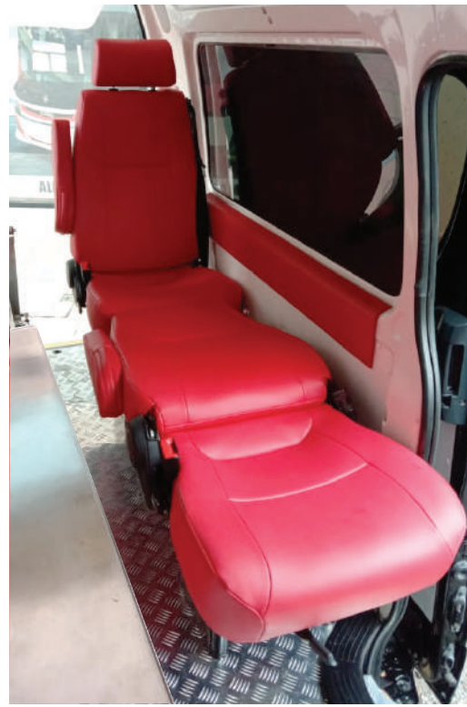
SECOND PATIENT PLATFORM