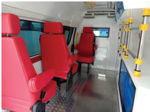
PARAMEDIC SEAT & STRETCHER PLATFORM