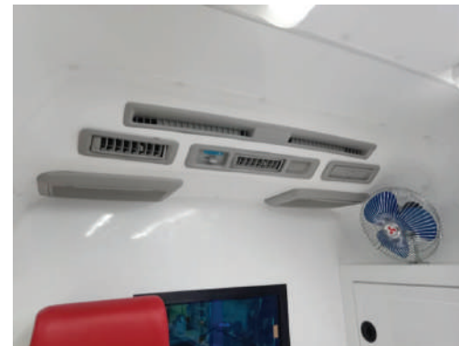
REAR COMPARTMENT AIRCOND LOUVER