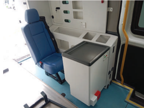
MEDICAL MOVABLE WORK DESK