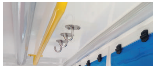
HANDGRIP & IV HOOK