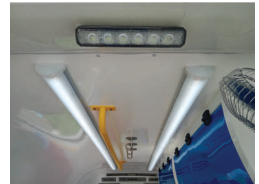
DIM & NORMAL LIGHT CABIN LOUVER