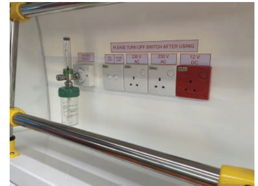
SWITCHES & PLUGS