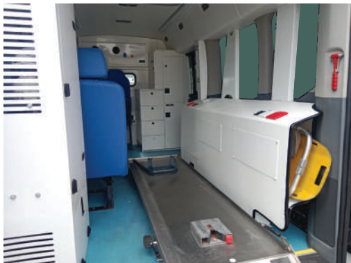
STRETCHER PLATFORM & SPINAL BOARD STORAGE