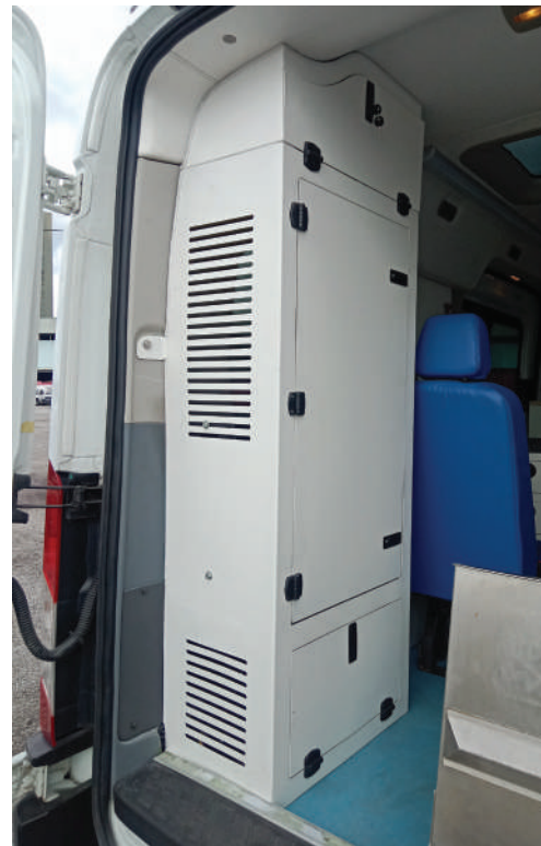
OXYGEN TANK COMPARTMENT